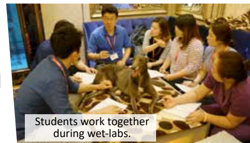
Students work together during wet-labs.