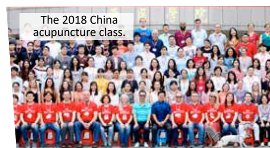
The 2018 China acupuncture class.