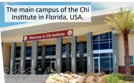
The main campus of the Chi Institute in Florida, USA.

To register: visit www.tcvm.com call 800-860-1543 email register@tcvm.com