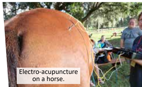
Electro-acupuncture on a horse.