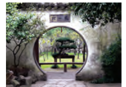
Classical Gardens of Su-zhou