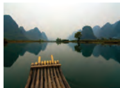
Li River Cruise

1) Longji Rice Terraces , take an excursion to visit these beautiful terraces, originated in Yuan Dynasty, which have been well kept for 700 years just as when they were first cultivated. Their owners are ethnic tribes, Miao and Yao people.