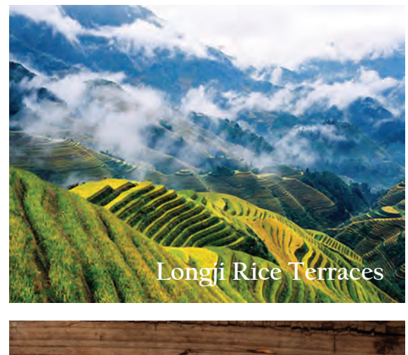
Longji Rice Terraces