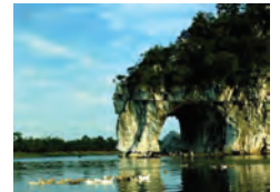
Elephant Trunk Hill

Group flies to Su-zhou, Jiangsu province for tour and conference. Group visits acupuncture needle manufactory and tours around Su-zhou/Shang-hai areas. Su-zhou was originally founded in 514 BCE. The city's canals, stone bridges, pagodas, and meticulously designed gardens have contributed to its status as one of the top tourist attractions in China. It is often dubbed the "Venice of the East".