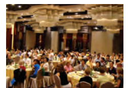
2010 Conference Banquet