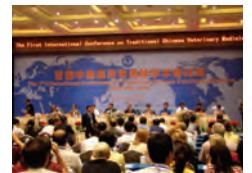
2010 Conference in Lan-zhou

Enhance your clinical and fundamental knowledge by learning from the top Chinese and International TCVM experts in 3-day lectures on Clinical Application and Scientific Validation of TCVM. Meet and share your experience with hundreds of TCVM colleagues from China, Korea, Thailand and other Asian countries. A local tour will be arranged for family members during the conference.