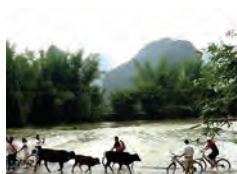
Bike Tour in Yangshuo

2) Li River Cruise , the highlight of any Gui-lin tour. Starting at Zhujiang Pier, cruise down along the enchanting Li River and disembark at Yang-shuo. En route, be inspired by breathtaking views of towering limestone peaks of various shapes, limpid waters, thriving groves, and locals working in fields.