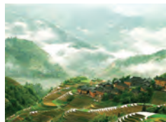
Longji Rice Terraces

Group flies to Gui-lin for 5 days pre-conference tour (highlights below). Gui-lin is in the Guangxi province, sitting on the west bank of the Li River. It has long been renowned for its unique scenery. Its name means "forest of Sweet Osmanthus", as large number of fragrant Sweet Osmanthus trees grow in the city.