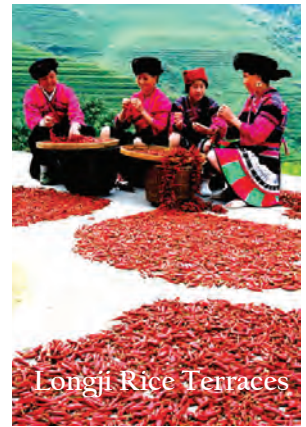
Longji Rice Terraces