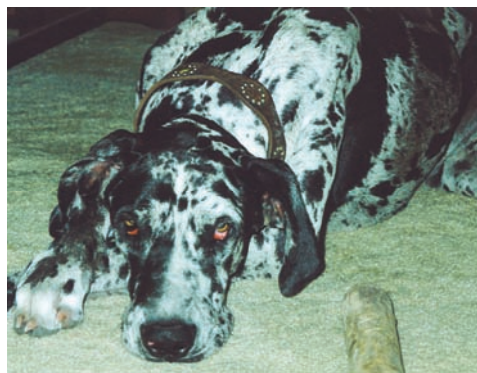
Elke, 130 pound, 4 years old

I used a 200g container, administered 0.5g per 10lb. of body weight to 2 dogs: a 130lb. Great Dane and a 55lb. mixed breed dog. I mixed the powder with their dry dog food, adding a little bit of corn oil. Both dogs liked the taste of this formula, making administration of the formula very convenient.